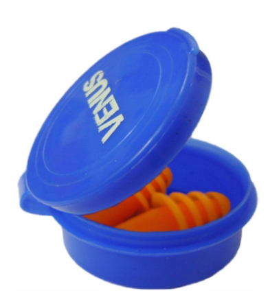
Flip-top Container (*optional)